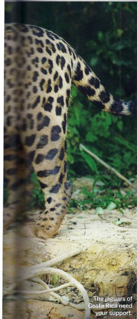
The jaguars of Costa Rica need your support.