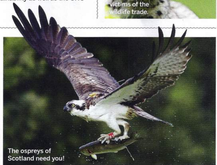
The ospreys of Scotland need you!