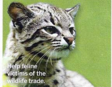
Help feline victims of the wildlife trade.