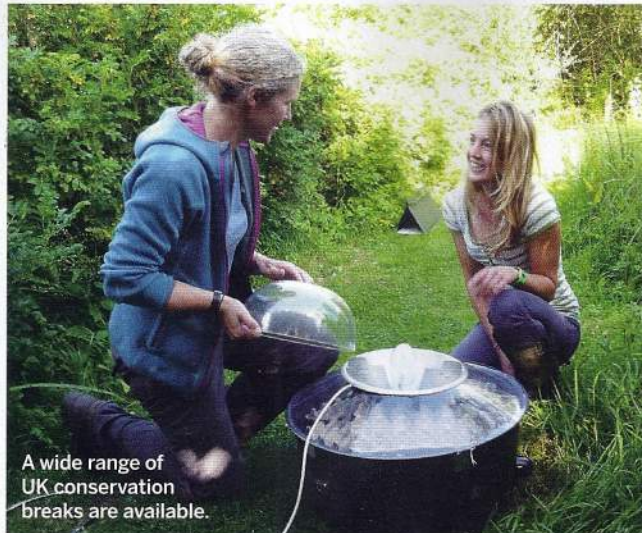
A wide range of UK conservation breaks are available.